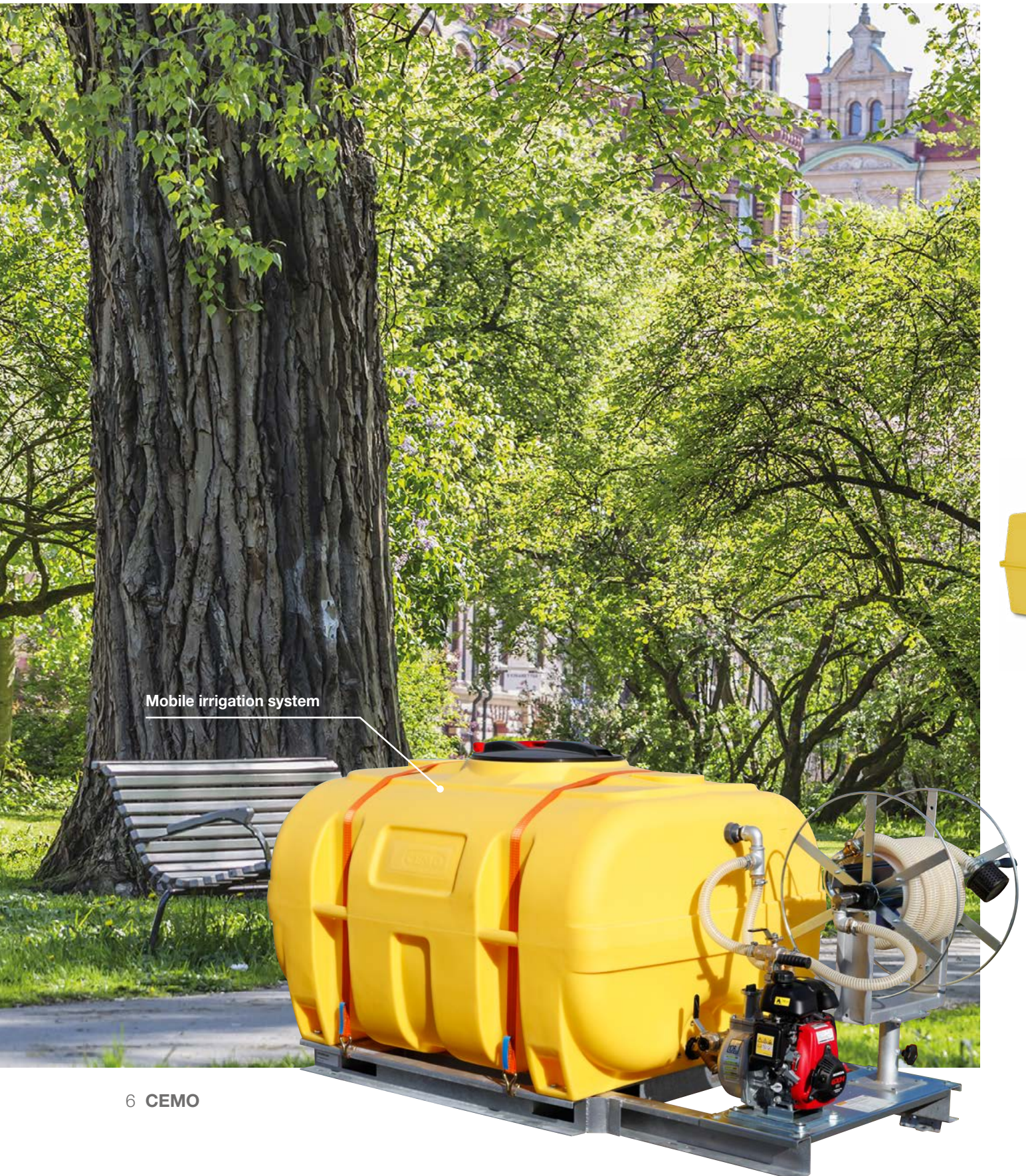
Mobile irrigation system