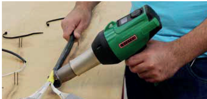
Shrink applications in cable manufacturing – ideal with the GHIBLI AW

practical device suspension make working easier. The air filters can be readily removed and cleaned. And of course, all of the nozzles from its predecessor fit the new GHIBLI AW.